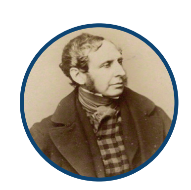
Image of Robert FitzRoy

Robert FitzRoy (1805-65) was Vice-Admiral to the Navy, a pioneering meteorologist and hydrographer. He was made the commander of HMS Beagle at the age of 23. He was appointed Governor of New Zealand in 1843. He is credited with inventing several barometers and devising sea charts to forecast the weather. Despite FitzRoy's explosive temper, he and Darwin were close friends during the voyage and he supported Darwin's work. FitzRoy subsequently distanced himself from Darwin's ideas and turned increasingly to religion.