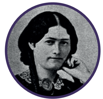
Image of Clémence Royer

'I received 2 or 3 days ago a French translation of the Origin by a Madelle. Royer, who must be one of the cleverest & oddest women in Europe: is ardent deist & hates Christianity, & declares that natural selection & the struggle for life will explain all morality, nature of man, politicks &c &c!!!'