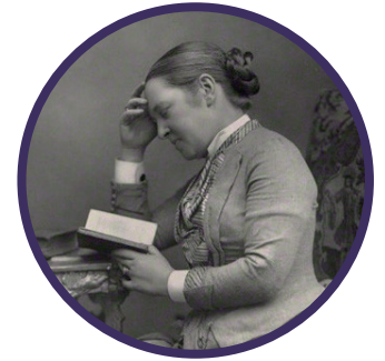
Image of Elizabeth Garrett Anderson

Elizabeth Garrett was born in Whitechapel, London. She was initially educated at home but at 13 was sent to boarding school. She was always interested in politics and current affairs but decided to pursue a career in medicine at a time when women were prevented from qualifying as doctors in Britain. She worked as a nurse while studying privately and was eventually allowed to attend the dissecting room and lectures at Middlesex Hospital until a petition by male students forced her to leave. She was refused entry to several medical schools but continued to study privately until taking her Society of Apothecaries exam in 1865, and was awarded a licence to practise medicine. She was the first British woman qualified to do so, but could not work at any hospital so set up her own practice, eventually providing medical care to poor women and children across London. In 1874, she co-founded the London School of Medicine for Women, the only teaching hospital to offer courses for women. A colleague of Darwin's wrote to Emma Darwin to ask her to support Garrett's becoming Professor of Physiology at Bedford College for Girls.